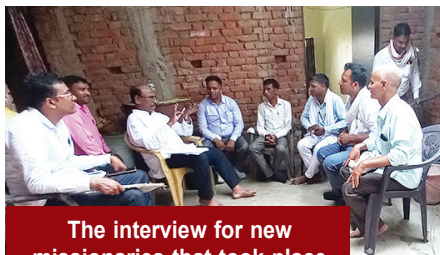
The interview for new missionaries that took place in Sudia, Uttar Pradesh.

When the permission was not granted for the construction of Church buildings, our believers used to gather in their house yards & house verandas to conduct the Sunday worship services. As this was also prevented, believers gathered together as a few families in house churches and worshipped the Lord in small