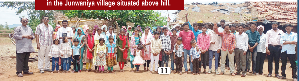
Our Organization Director along with the believers in the Junwaniya village situated above hill.