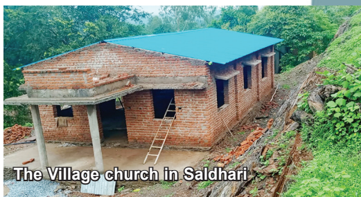
The Village church in Saldhari

The times when we could construct the Church buildings and prayer Halls, and worship our Lord in a congenial, holy, and peaceful atmosphere is gradually disappearing and the situation is emerging that it may not be possible for us to construct churches and prayer halls in North India in future because in Uttar Pradesh it is in their planning to bring the Prohibition of Land Transfer Act along with the Anti-Conversion Act. The purpose of this plan is to control the increase in the number of churches by opting for the registration of the existing church buildings and after that to deny permission for the purchase of land and the construction of new church buildings. If it is successfully implemented in Uttar Pradesh, this amendment will be introduced in other states as well. Let's continue to pray that God would defile their efforts as Ahithophel's advice and convert it as an advantage to us.