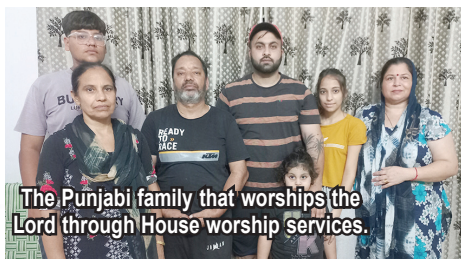
The Punjabi family that worships the Lord through House worship services.