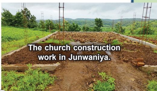
The church construction work in Junwaniya.