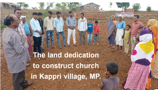
The land dedication to construct church in Kappri village, MP.