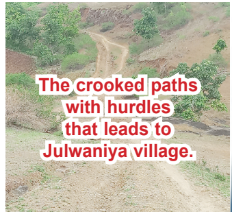
The crooked paths with hurdles that leads to Julwaniya village.

Political and religious obstacles for evangelism continue to increase. The punishments under the Anti Conversion Act of 3 years imprisonment and Rs 50,000 have been revised and increased to Rs 10 lakhs and life imprisonment in Uttar Pradesh and thus all the religious forces are working together to create fear upon fear and terror upon terror